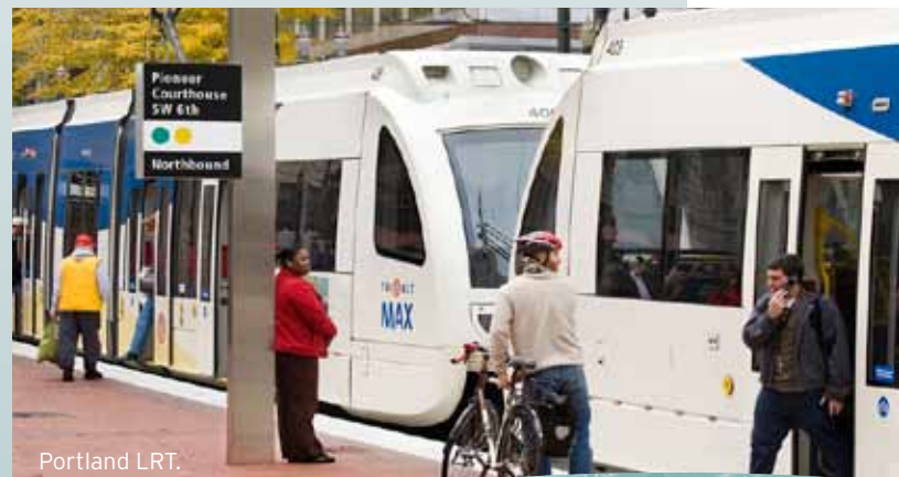
Portland LRT.

The table on the following page shows how the benefits of the current transit options stack up to those of the full Transit City implementation, in particular the ability to connect and bring transit to Torontonians across the city, especially those that need it most.