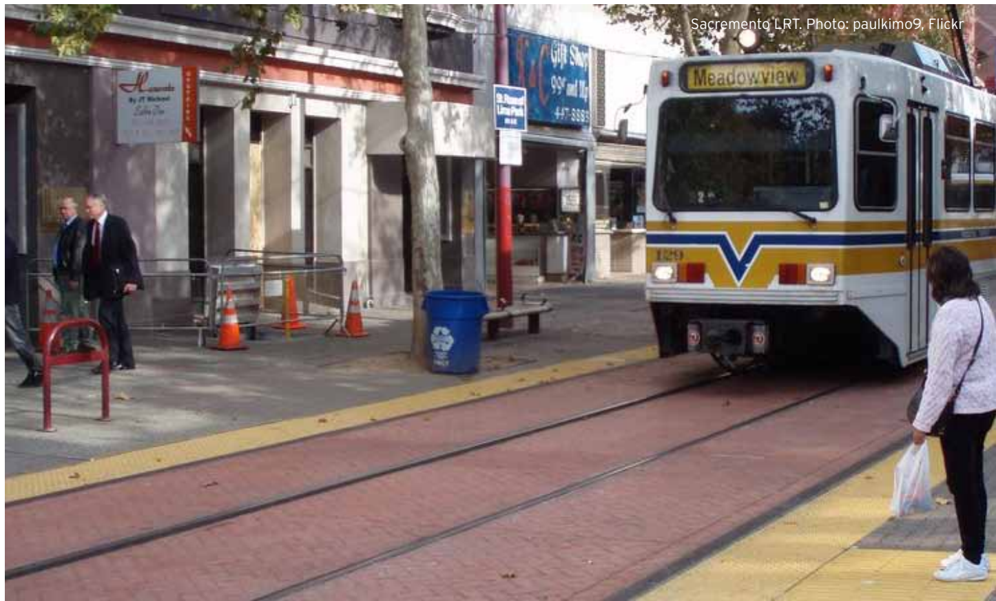
Sacramento LRT.

Based on this information, it is more fiscally responsible to build LRT lines along these routes. The high cost of subways cannot be justified based on either projected ridership or projected densities.