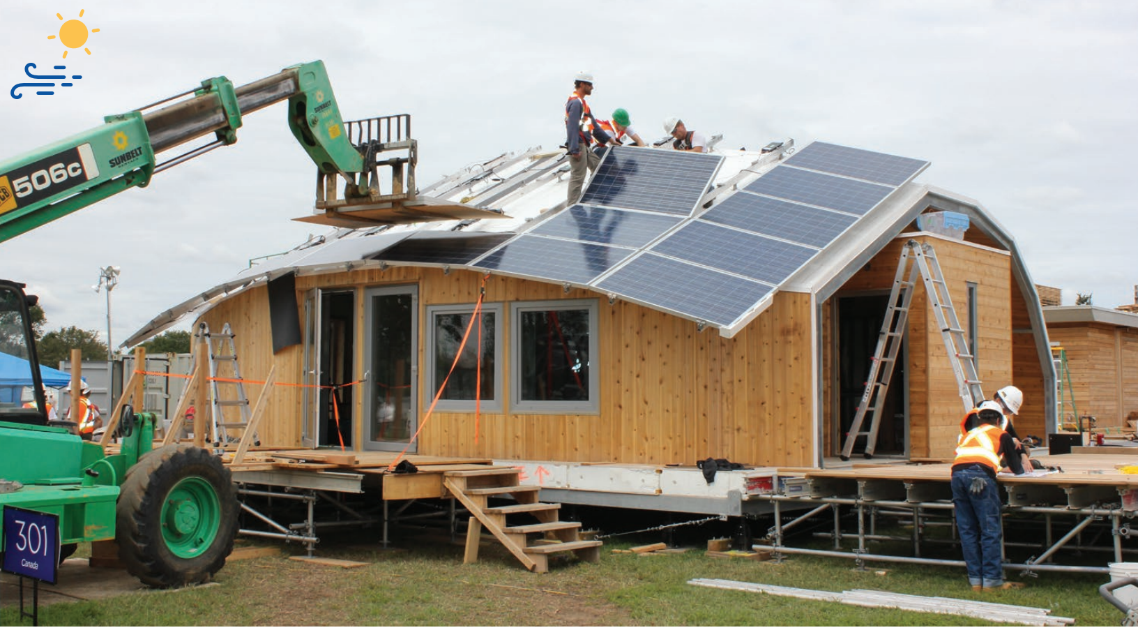
Installing solar panels on the roof of a Traditional Living house at the University of Calgary.

recognizing that the price is falling) and not viable to transmit to outside markets.<sup>49</sup> They also had mixed views about whether the skills of one industry could simply be transferred directly to another. And, as noted above, they believe that the global market for oil — and therefore for Alberta's exports — will continue far into the future.