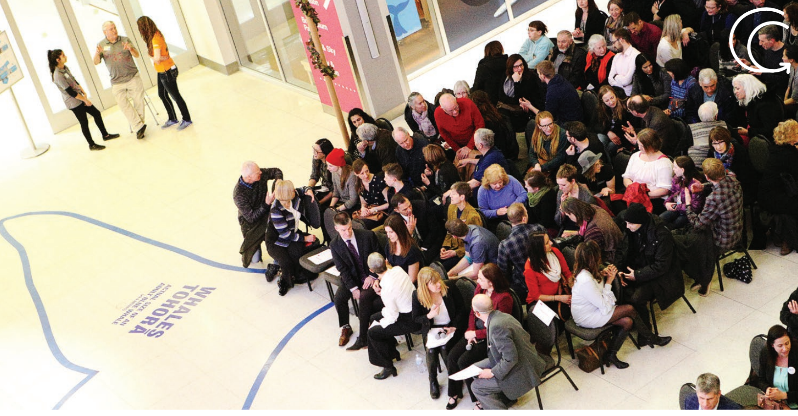
Talking about climate change at an Alberta Narratives Project event at TELUS Spark, Calgary.