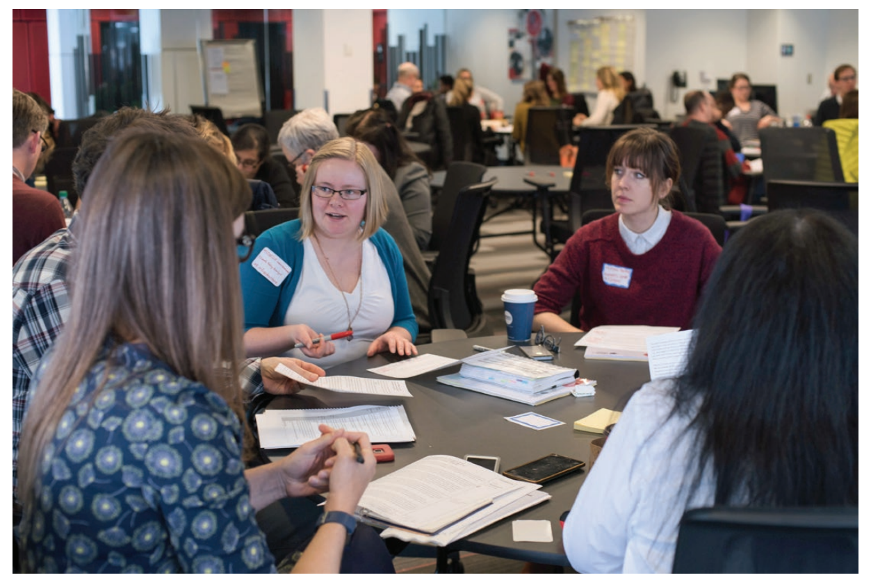
One of the table groups at Training Session One in Calgary.