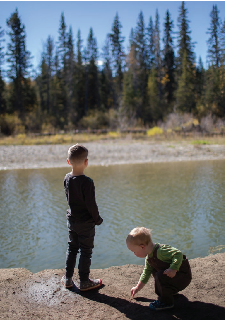
Young boys play at Fish Creek Park in Calgary.