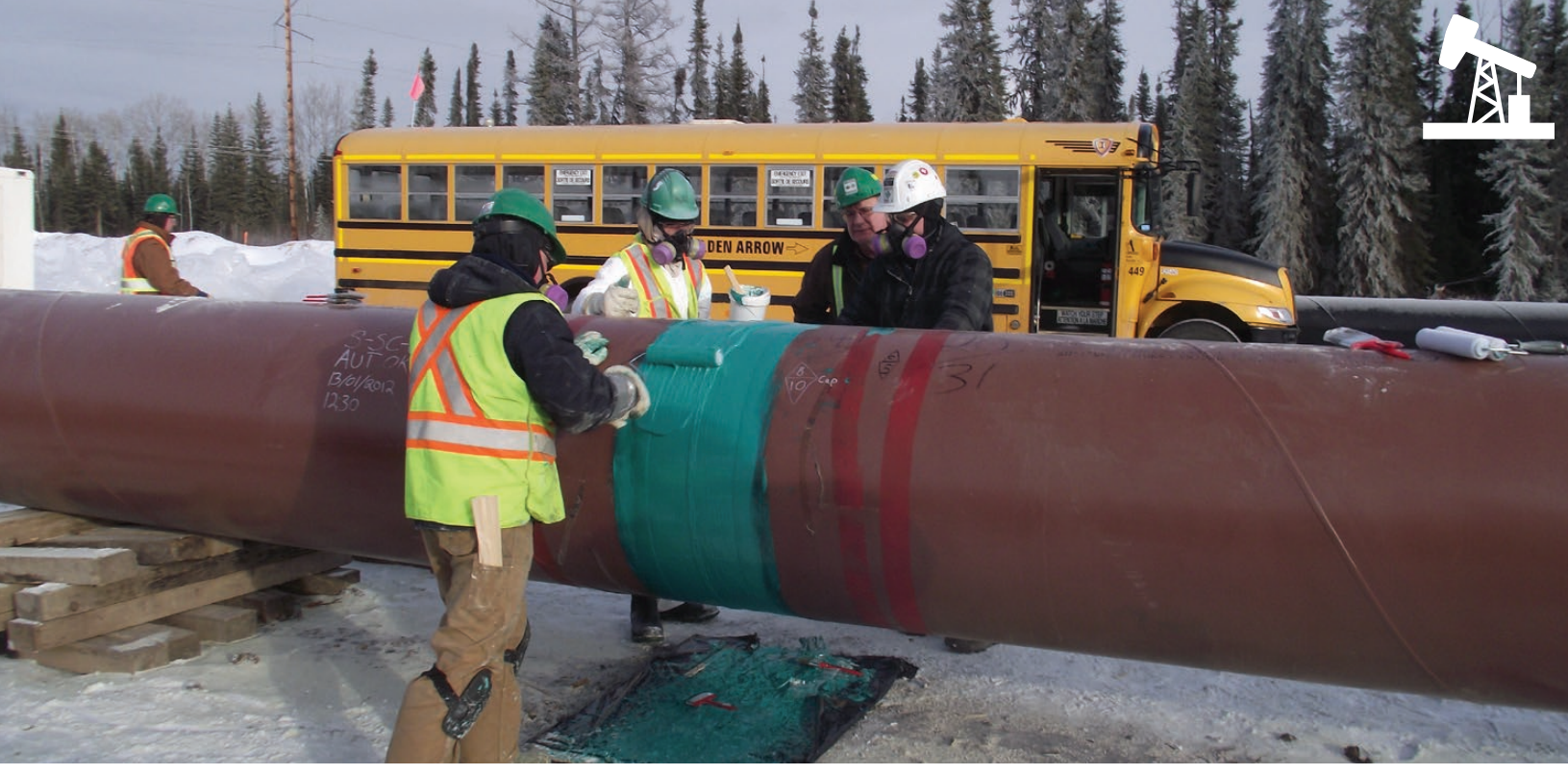
Albertan oil workers applying epoxy coasting to a pipeline.