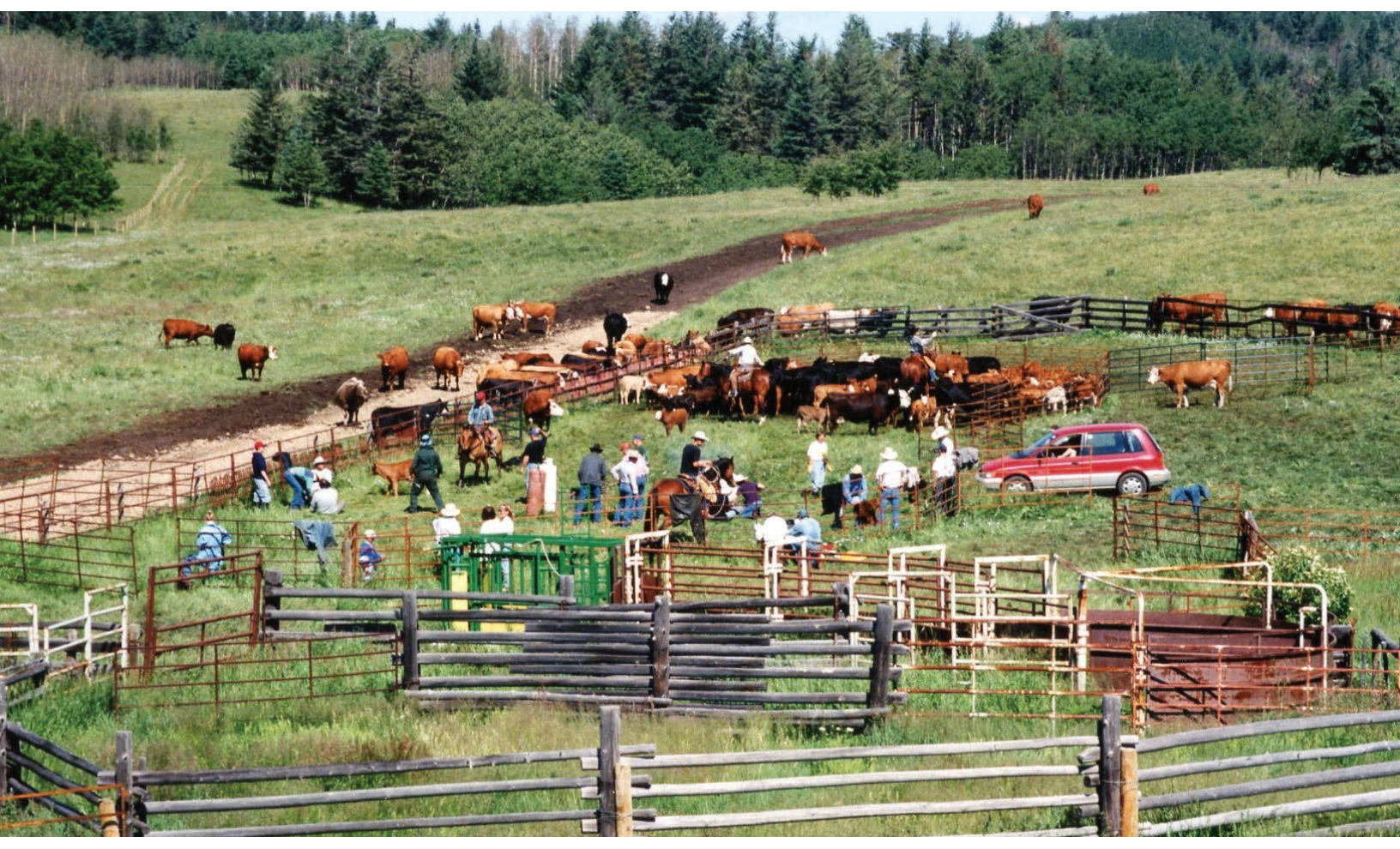
Family and neighbors gathered to round up and brand cattle in the Wildcat Hills, west of Cochrane.

G There are facts and facts don't lie. Your opinion is not more valid than these facts and your opinion is not more valid than somebody else's opinion. You know what I mean? It's very frustrating when people push their opinions on others without really understanding the basis of their opinion. That's one of the things that really bothers me." -Farmers Group