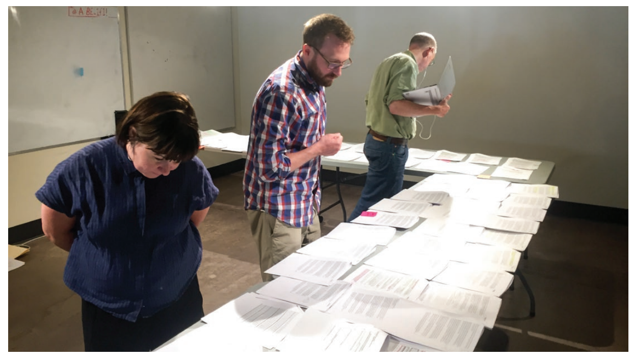
Reviewing the marked-up test narratives.

The research team conducted a detailed analysis of the online questionnaire feedback and over 700 pages of transcripts to confirm the findings from the Evaluation Training session and draw out any additional insights. All 550 copies of the marked-up test narratives were laid out alongside each other and cross-compared to produce the final conclusions. The draft text for this report was then reviewed by the advisory group and further amended.