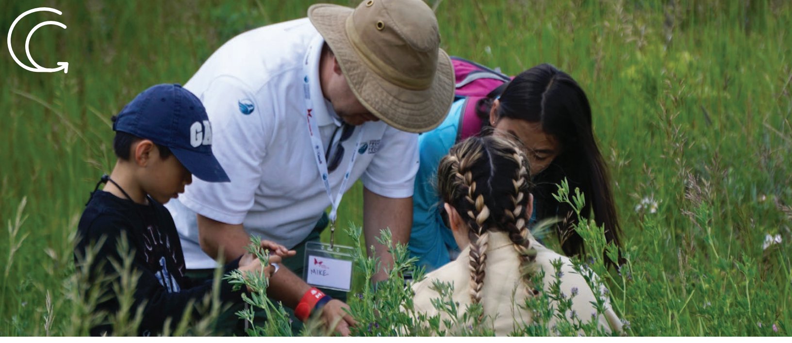
Students identifying species at the Calgary BioBlitz.

Provincial-level agencies and institutions could also initiate a programme of systematic conversations. In Scotland, for example, the government has enshrined community conversations as a central part of its climate strategy, and we recommend this approach in Alberta.<sup>41</sup>