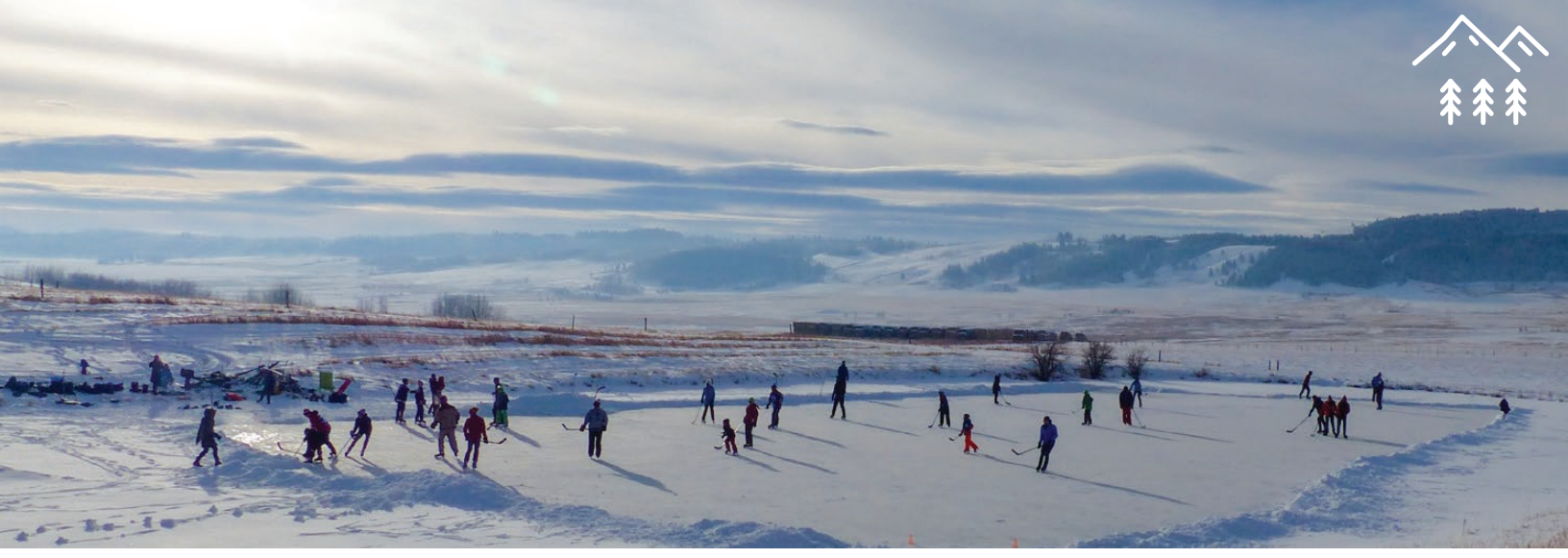
20C game of hockey, Boxing Day party, Grand Valley Road, west of Calgary.

66 I am proud to be Albertan, but I don't know if I know exactly why. I love Alberta for the mountains, but I also think that a large reason people are here is for opportunity. A lot of people move here to Alberta for opportunity and I think the new people that come here are often willing to take chances, which is what I like." -Environmental Group