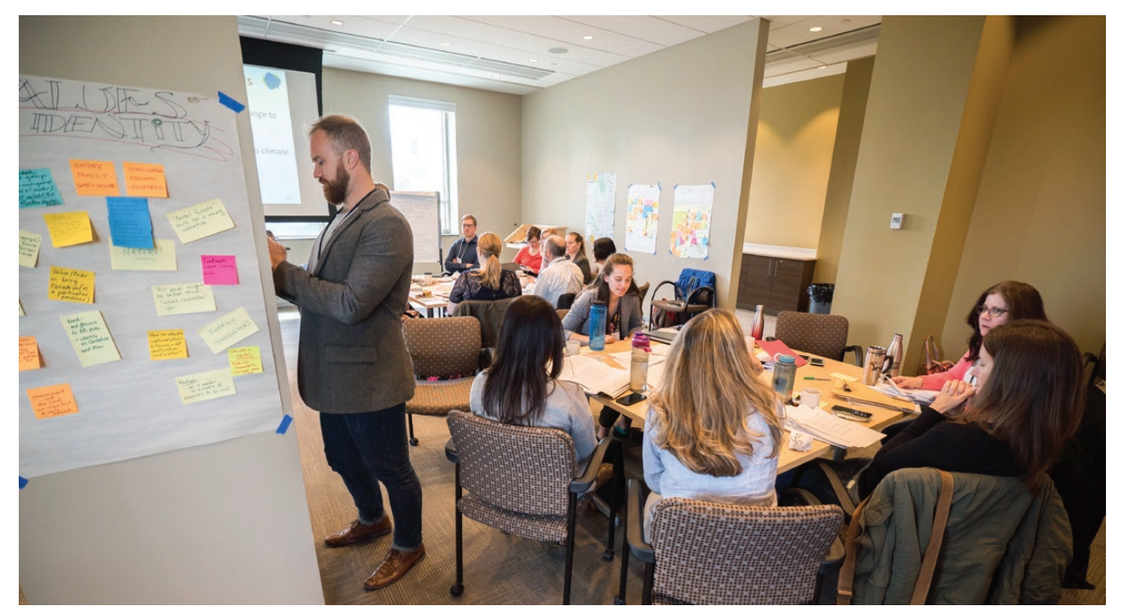
Working in small groups to draw out the main findings, at Training Session Two in Edmonton.