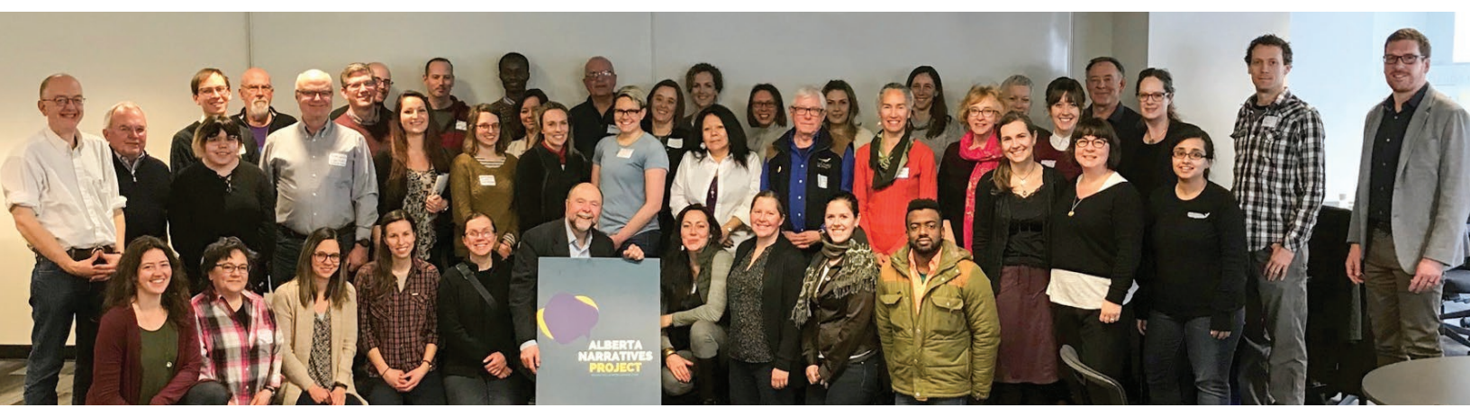
The Alberta Narratives Project team at the first training session in March 2018.

We want to thank our trained facilitators for dedicating so much time and resources to participate in this project, contributing their ideas and insights, recruiting and running groups, and attending the training and evaluation events.