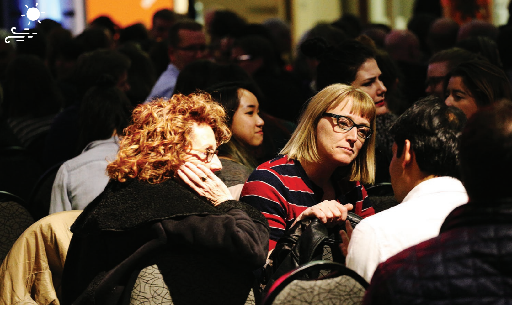
Listening to each other at an Alberta Narratives Project event at TELUS Spark, Calgary.