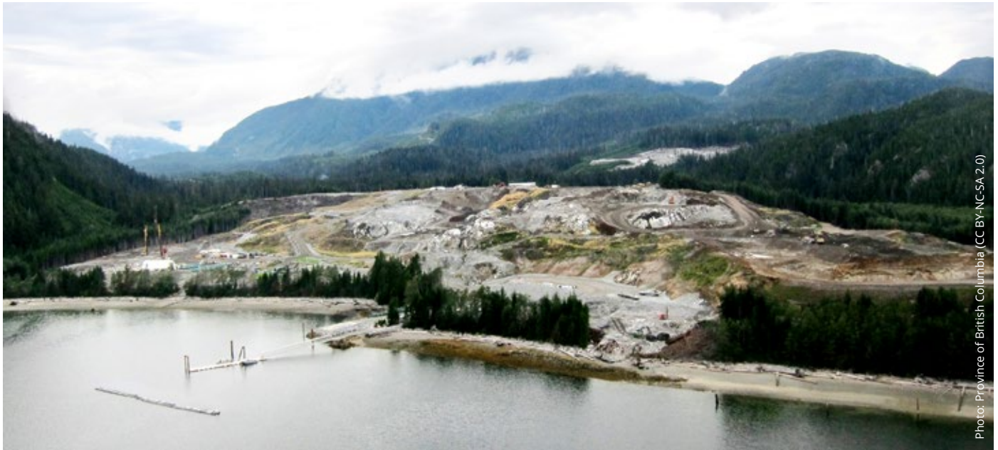
The carbon emissions impacts of liquefied natural gas development in B.C. gained political traction over 2016. Pictured above is preliminary work at the Kitimat LNG site.

In B.C., the carbon emission impacts of fracking and liquefied natural gas (LNG) development gained much political traction over the past year. We were invited to collaborate with First Nations, local governments and community groups on opportunities to intervene or provide input on shale gas development. We also provided fact sheets and other communications materials as well as presentations on water impacts — freshwater required and wastewater produced.