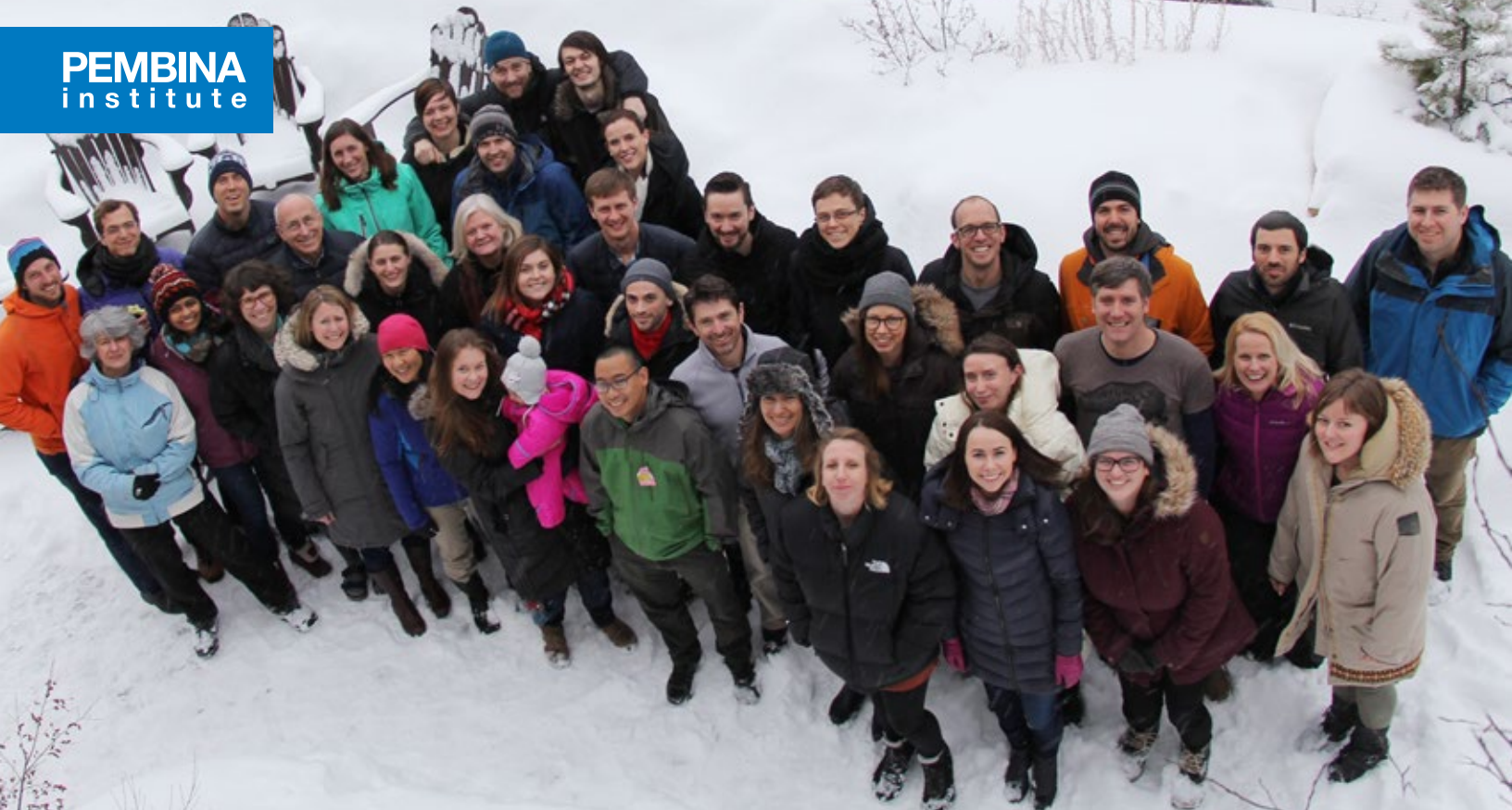
Pembina Institute staff at the organization's annual assembly, February 2017.