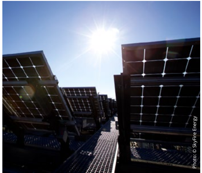
In 2016, IRENA reported that the number of people employed in the renewable energy sector in the U.S. surpassed those employed in the oil and gas sector.