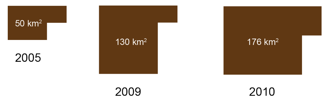
Figure 2. Growth of tailings lakes by surface area since 2005

Because it is not being enforced and because its design was limited to only require operators to reduce a portion of the volume of future tailings waste, tailings volumes continue to grow today, as illustrated in the figure below.