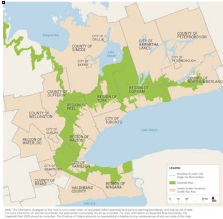
Figure 1. The Greater Golden Horseshoe 10

and stores within an easy walk and 59% said they would choose a smaller house if it meant a commute time of 20 minutes or less. However the study also noted that policies and housing stock are not reacting to this interest.