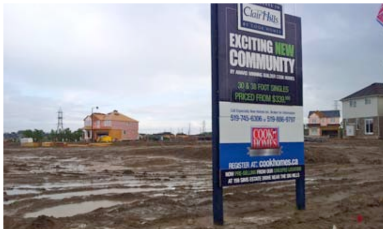
Current policies support less location-efficient, sprawling alternatives.

Location efficiency can occur outside of the urban Toronto core. For example, as Markham grows commercially and residentially, some of its neighbourhoods around employment hubs are becoming walkable, allowing people to live and work in the same community. Other neighbourhoods are accessible by rapid transit, allowing commuters to efficiently move from home to job without getting stuck in traffic. Location efficiency can also occur in places like central Aurora, with a GO train line for commuting to jobs located in Toronto and a walkable urban centre.