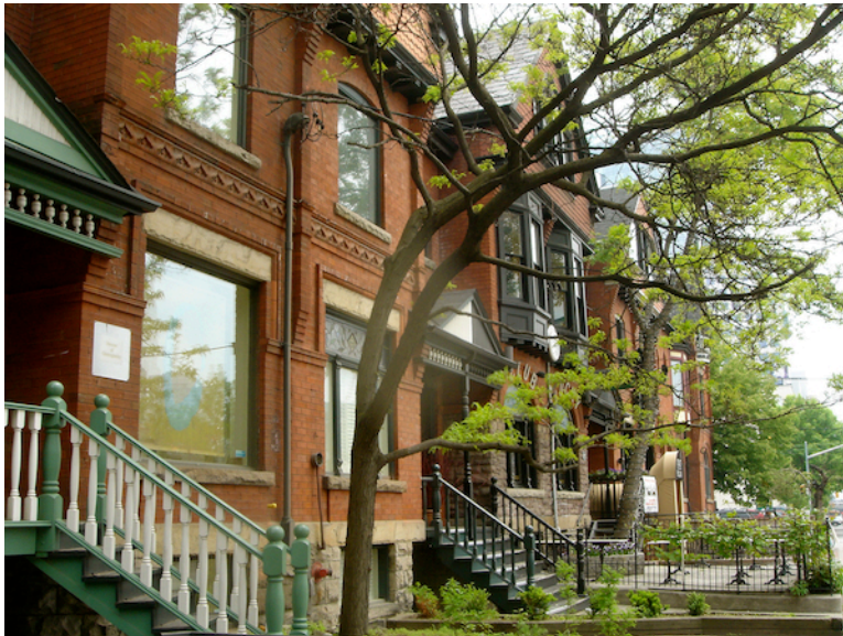
Location-efficient development can come in many forms.

Location efficiency includes a range of building types, not just residential towers. The kind of incremental increases in density needed to build location-efficient communities can occur with an increase in the number of attached, medium- and high-rise buildings that respect neighbourhood character, while also prioritizing higher densities around transit hubs and amenities. One important question is: what level of transit is best for a given area? Higher densities are needed to support higher-order transit.